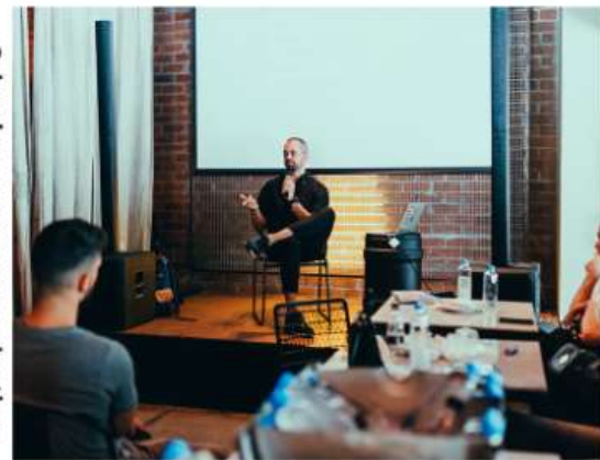
School courseware production