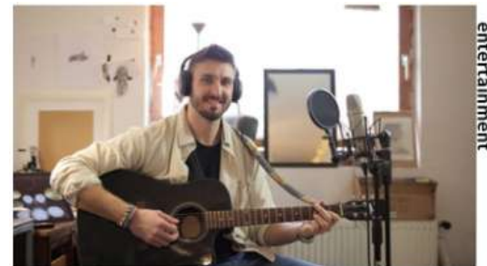
Short video performance entertainment