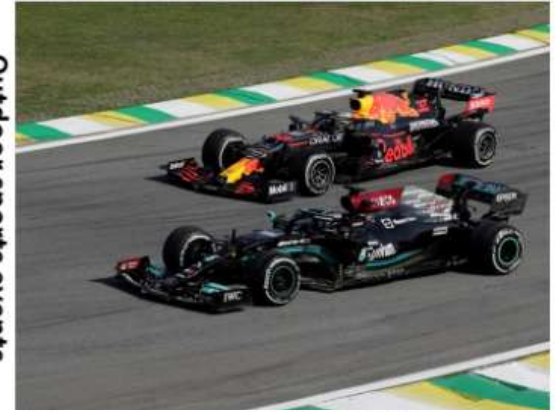
Outdoor sports events