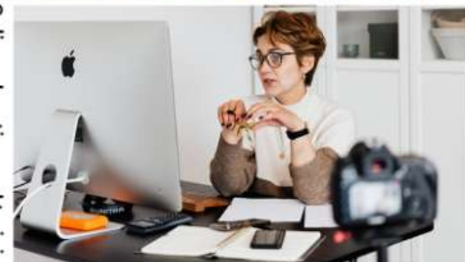
Online education and training